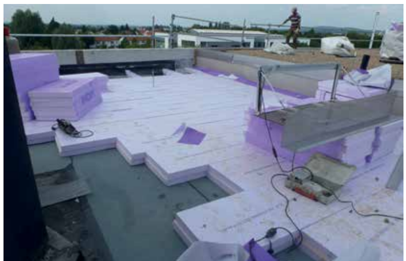
Inverted roof insulation with JACKODUR Plus for University of Applied Sciences in Lemgo

Hence the company's search for a gas blowing agent (GBA) that would help improve on Lambda levels of 34-37 mW/mK using CO 2 (JACKODUR KF) or HFC-152a (JACKODUR CFR). XPS produced using HFC-134a exhibited better thermal conductivity (29-31 mW/mK) but at a high global warming potential (GWP) of 1,300*1.